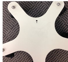
Figure 2: Base