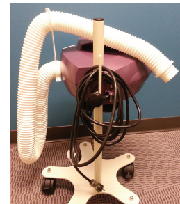
Figure 8: Secure