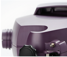
Figure 5: Top handle