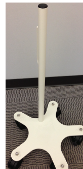
Figure 4: THC5 assembly