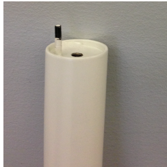
Figure 1: Pin