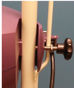
Figure 7: Mistral-Air onto the THC5 stand