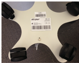
Figure 3: Bottom of the base